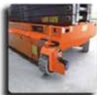
Tight Turning Radius