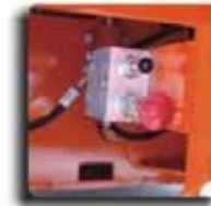
Brake Release Valve