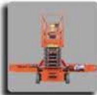
Swing Out Tray