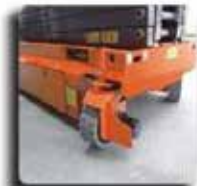
Tight Turning Radius