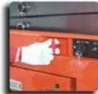
Emergency Lowering System