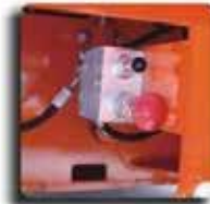
Brake Release Valve