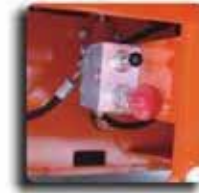
Brake Release Valve