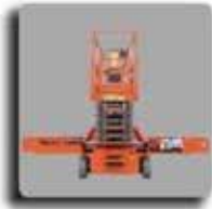
Swing Out Tray