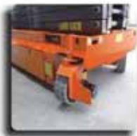
Tight Turning Radius