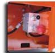
Brake Release Valve