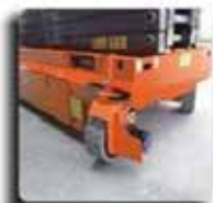
Tight Turning Radius